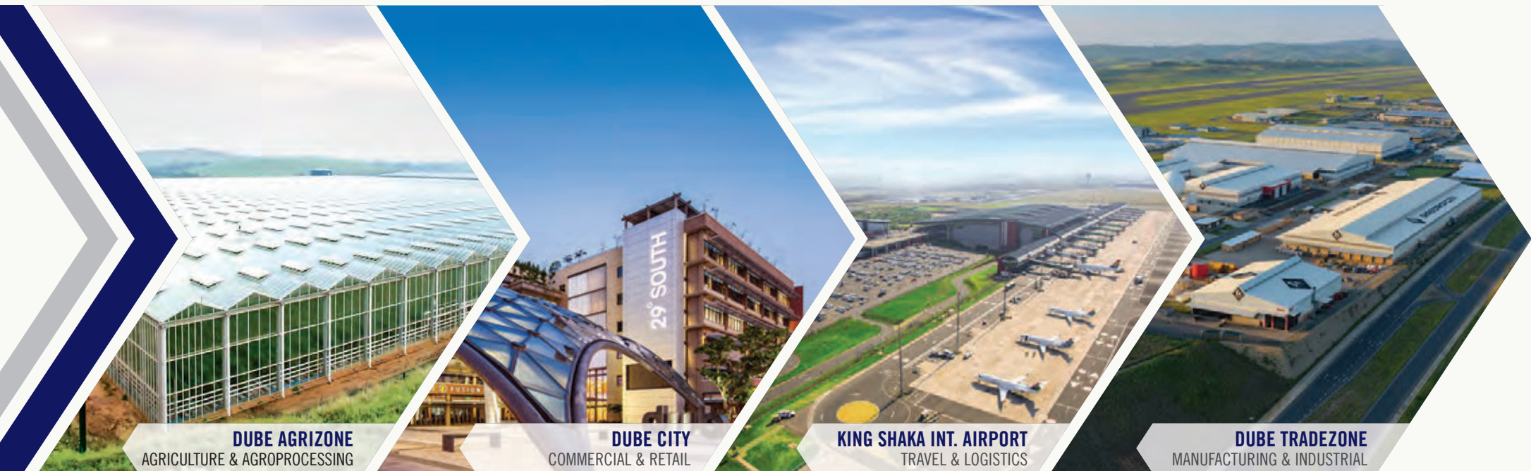
DUBE AGRIZONE AGRICULTURE & AGROPROCESSING