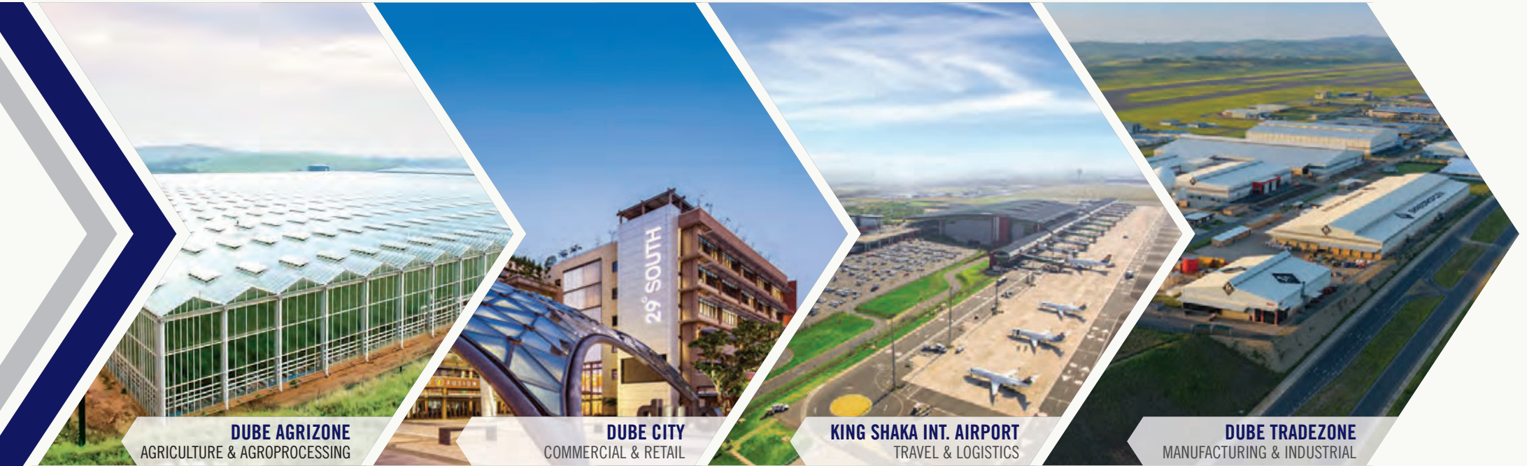
DUBE AGRIZONE AGRICULTURE & AGROPROCESSING

AFRICA'S GLOBAL MANUFACTURING AND AIR LOGISTICS PLATFORM